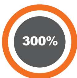
Increase in Productivity

With the success from this engagement, the client has increased the scope to include two new product offerings and is exploring a fully outsourced engagement model.